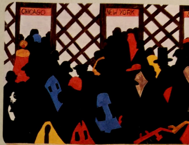
The Migration of the Negro Panel no. 1 (1940–1941), Jacob Lawrence Casein tempera on hardboard, 12" x 18". Acquired 1942. The Phil Collection, Washington, D.C. © The Estate of Gwendolyn Knight Lawrence/Artist Rights Society (ARS), New York.