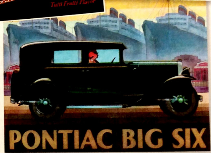
Print advertisements from the 1920s and 1930s