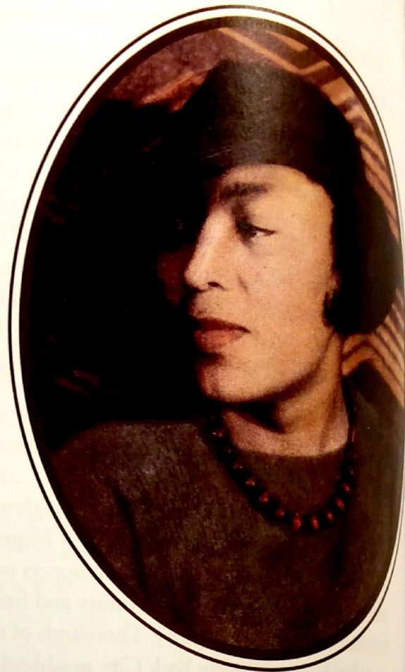
Zora Neale Hurston, Harlem Renaissance writer

REPORTING THE ERA Fresh out of high school in 1917, Ernest Hemingway worked as a reporter for the Kansas City Star . The newspaper’s strict rules of