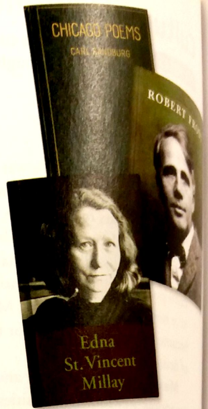
Works by transitional poets Millay, Frost, and Sandburg

Experimentation was a distinguishing characteristic of these writers. “Make it new,” extolled Ezra Pound as he urged fellow poets to abandon the artifice of past forms and search for their individual voices. Harriet Monroe , editor of Poetry magazine, wrote that the new poetry “has set before itself an ideal of absolute simplicity and sincerity—an ideal which implies an individual, unsteretyped diction; and an individual, unsteretyped rhythm.” The lack of